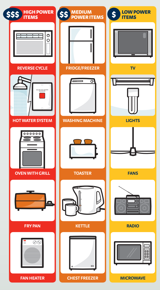
Save power - turn items off when not in use