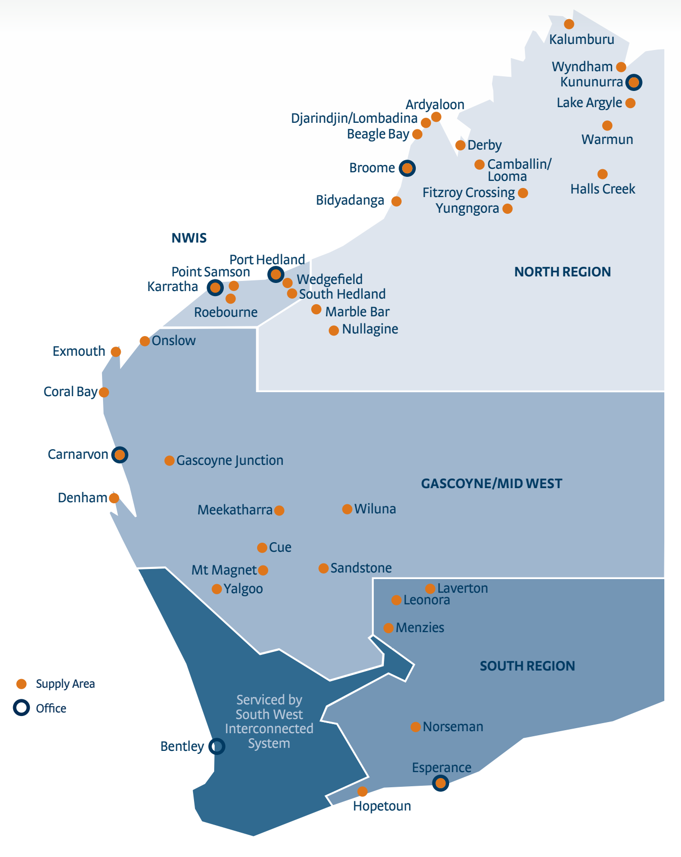
Figure 1 - Horizon Power's Service Area