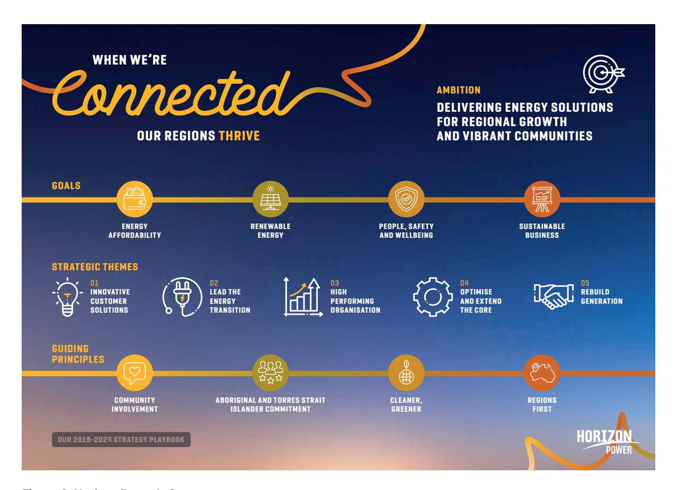
Figure 2: Horizon Power's Strategy