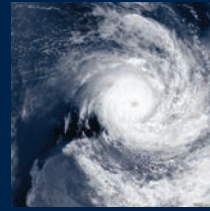
Preparing for Cyclones and Storms